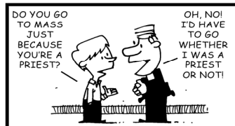
3rd SUNDAY OF LENT / LAWS & WORSHIP