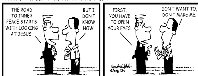
4th SUNDAY OF LENT / THE SON OF MAN LIFTED UP

1-888-276-4490 La Diócesis de Yakima tiene una Línea Directa para cualquier persona que desea reportar un incidente de Abuso Sexual cometido por un clérigo clero, religioso, empleado diocesano, o voluntario.