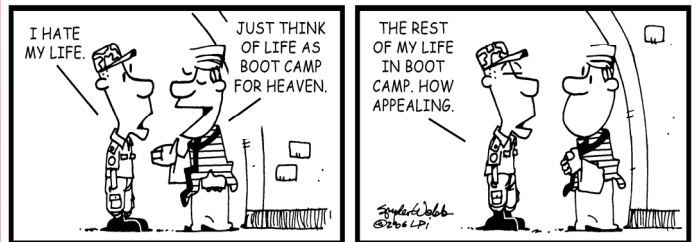
5th SUNDAY OF LENT / DEATH AS A METAMORPHOSIS INTO A BETTER LIFE