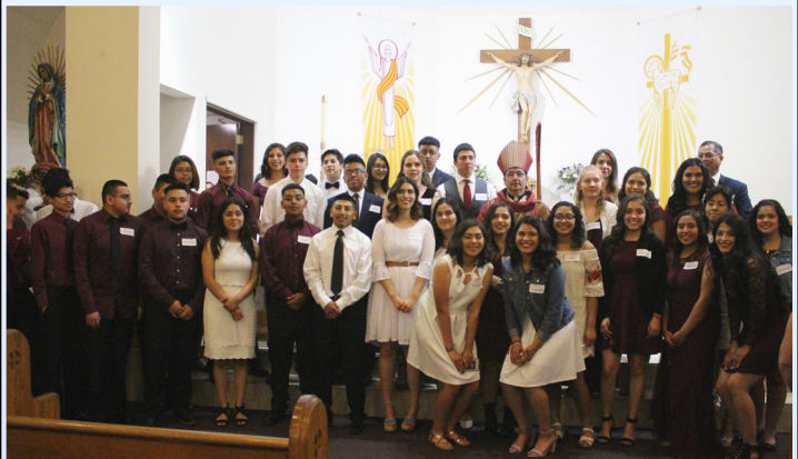
CLASS OF 2018!

MAY FEST DONATIONS If you would like to contribute for the May Fest please consider bringing a case of soda to the office or a pie for the Knights of Columbus booth. Thank you for your consideration.